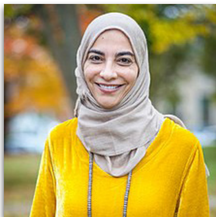
Dr Hyat Sindi Medical Scientist

You can use one of the scientists shown on this page or those featured on Dynamic Earth Online as a starting place, but you may need to do some of your own research too. You can also research any scientist you like - Find someone you are interested in learning about!