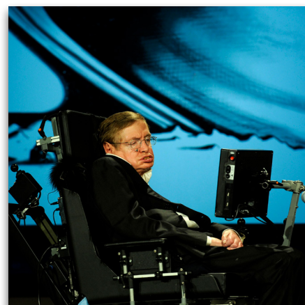
Professor Steven Hawking Physicist and Cosmologist