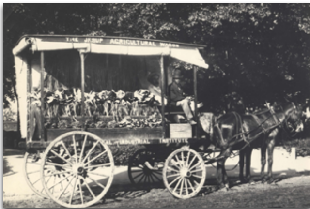
A Jesup Wagon

Farmers at the time were struggling to grow food as decades of growing Cotton had ruined the soil quality. One of his first inventions was the Jesup Wagon, which you can see in the picture. This was a mobile classroom that allowed farmers to test their soil and learn how to grow new crops.