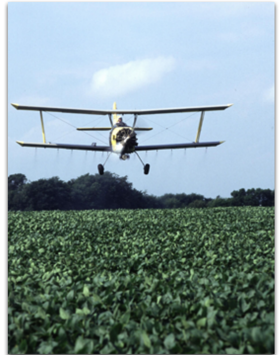
A cropduster plane over a field of soybeans in the US. Up until 2020, the US was the world's biggest producer of soybeans.

He also came up with hundreds of ways to use these crops including different ways to eat them, using them in lotions, soaps and dyes and even as fuel. Carver was the first person to suggest growing Peanuts in the USA and it rapidly became the 6th leading crop in America. This gave him the nickname the Peanut Man.